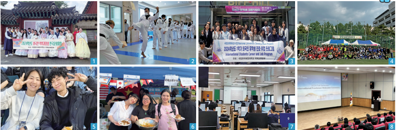
1 Korean Cultural Experience Program 2 Taekwondo Experience 3 International Students' Career and Job Program 4 International Students' Day 5 KMOU BUDDY and Mentoring Program 6 KMOU Global Cultural Experience 7 Allowance for students with a TOPIK grade 8 Freshmen Orientation and Early Adaptation Program