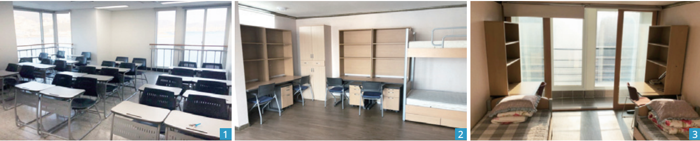
1 Korean language classroom